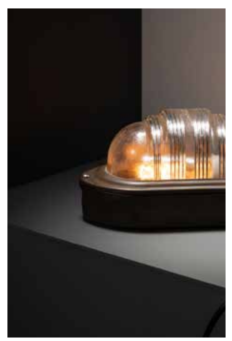
White Industrial Aluminium