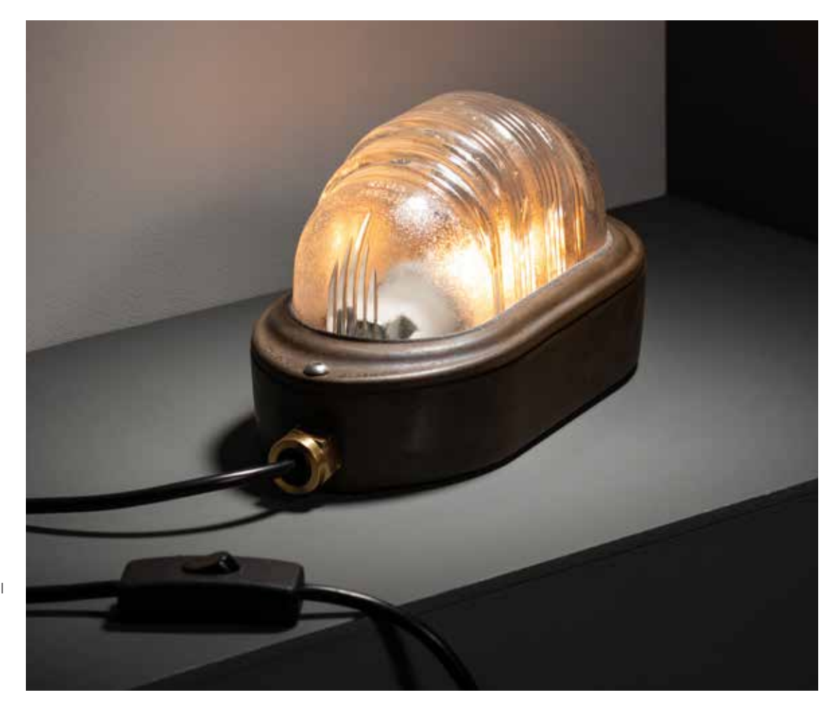
3. SY-6 Compact Oval Fluorescent Table Bulkhead, Rocker Switch Detail

Open new possibilities with our corded SY-6 Bulkhead. Plug in and flood soft light across bookcases, bedsides, or artwork. Beautiful in a family living room and robust enough for any hotel bedroom.