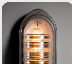
WEATHERED BRONZE [WBRONZE]