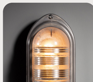
NATURAL SILVER [S]