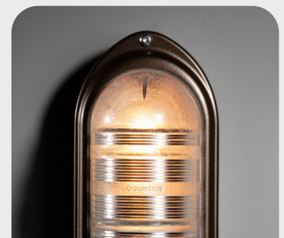
ANTIQUE BRONZE [BRONZE]