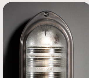
NATURAL SILVER [S]