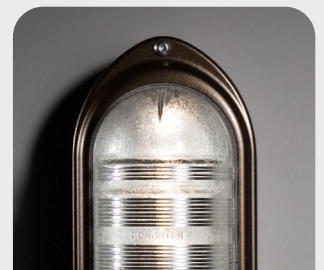
ANTIQUE BRONZE [BRONZE]