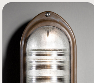
WEATHERED BRONZE [WBronze]