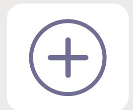
YOUR CUSTOM RAL COLOUR